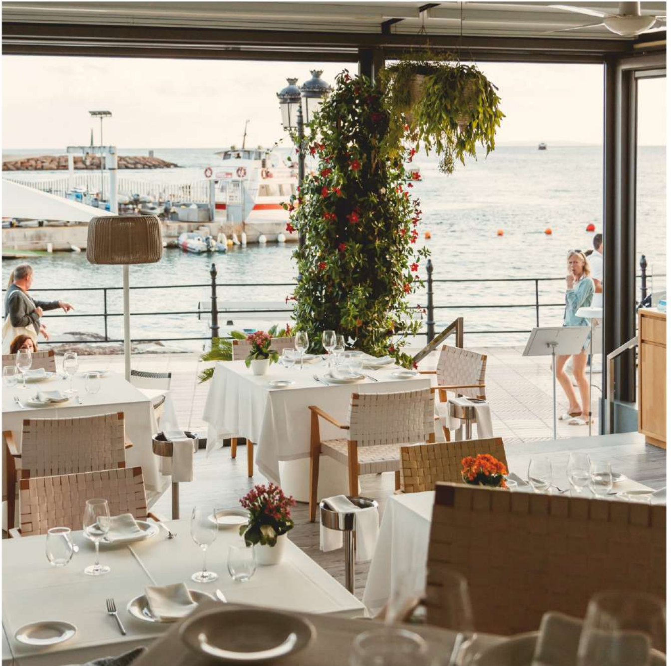
ESTEL BY CAN CURREU