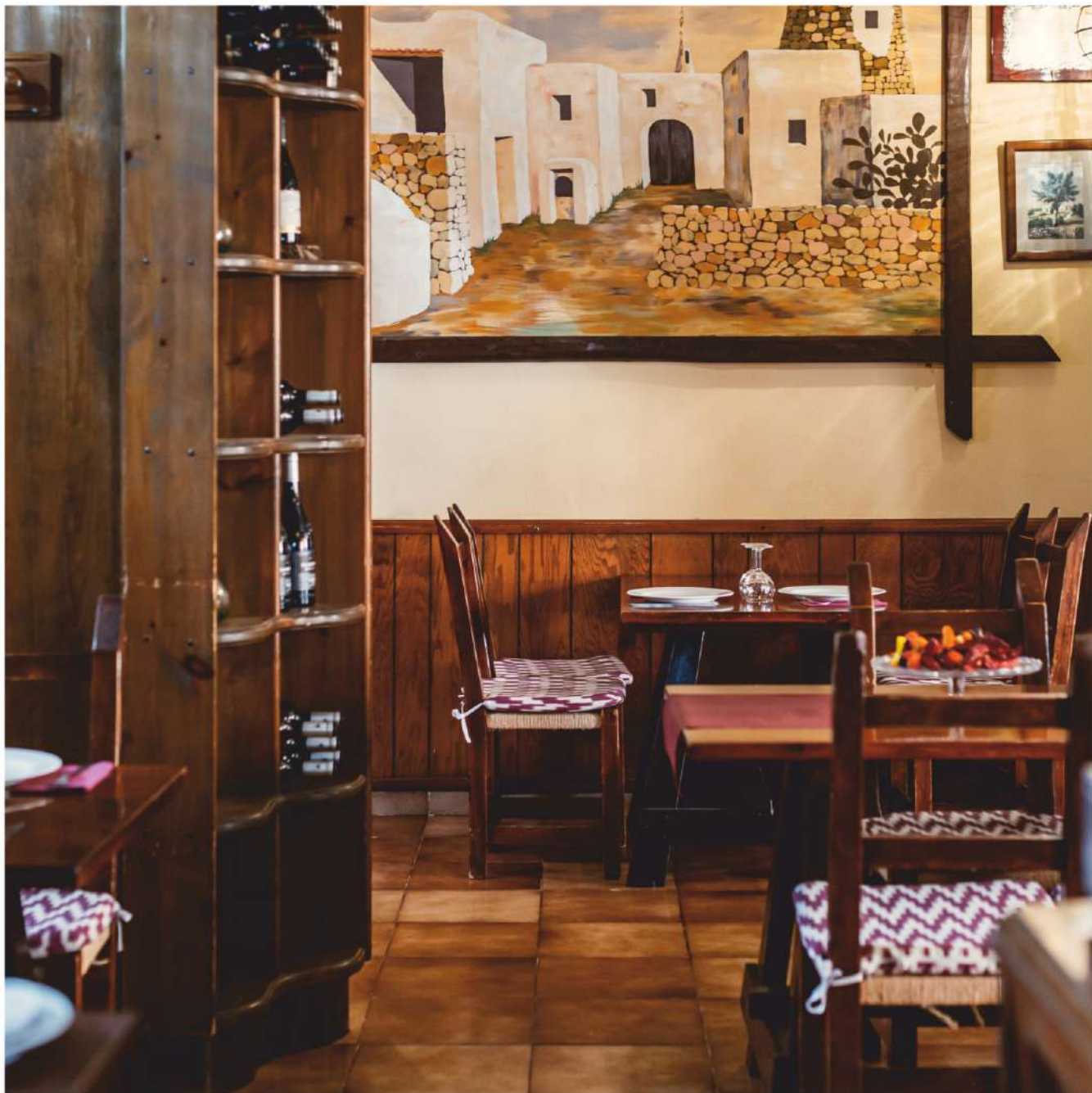
RINCÓN DE PEPE