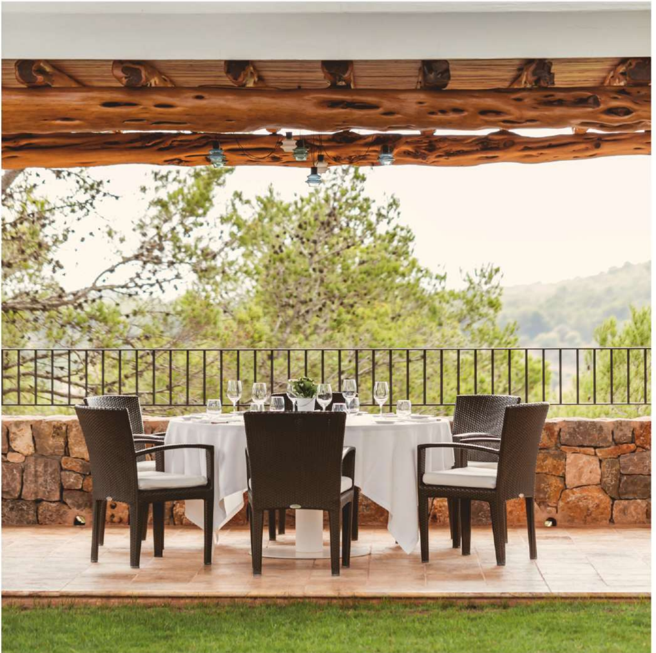
HOTEL RURAL & SPA CAN CURREU