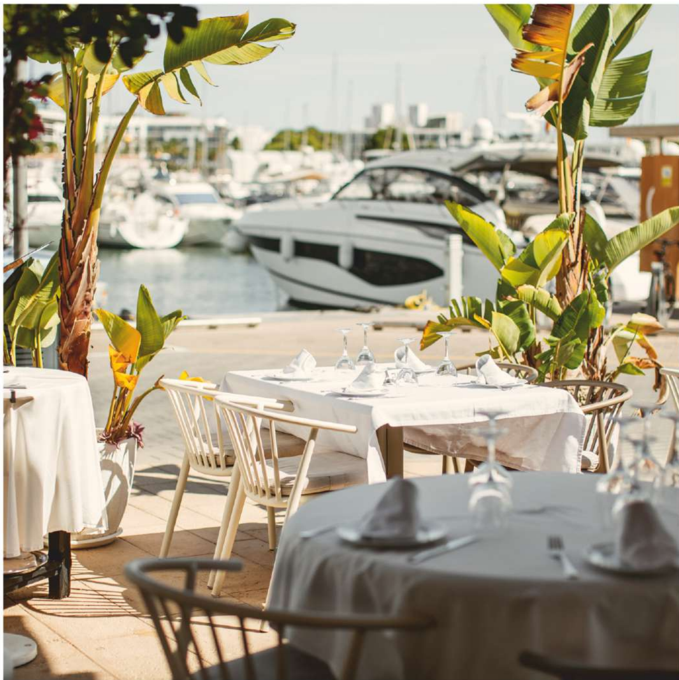
ES MIRADOR DES PORT