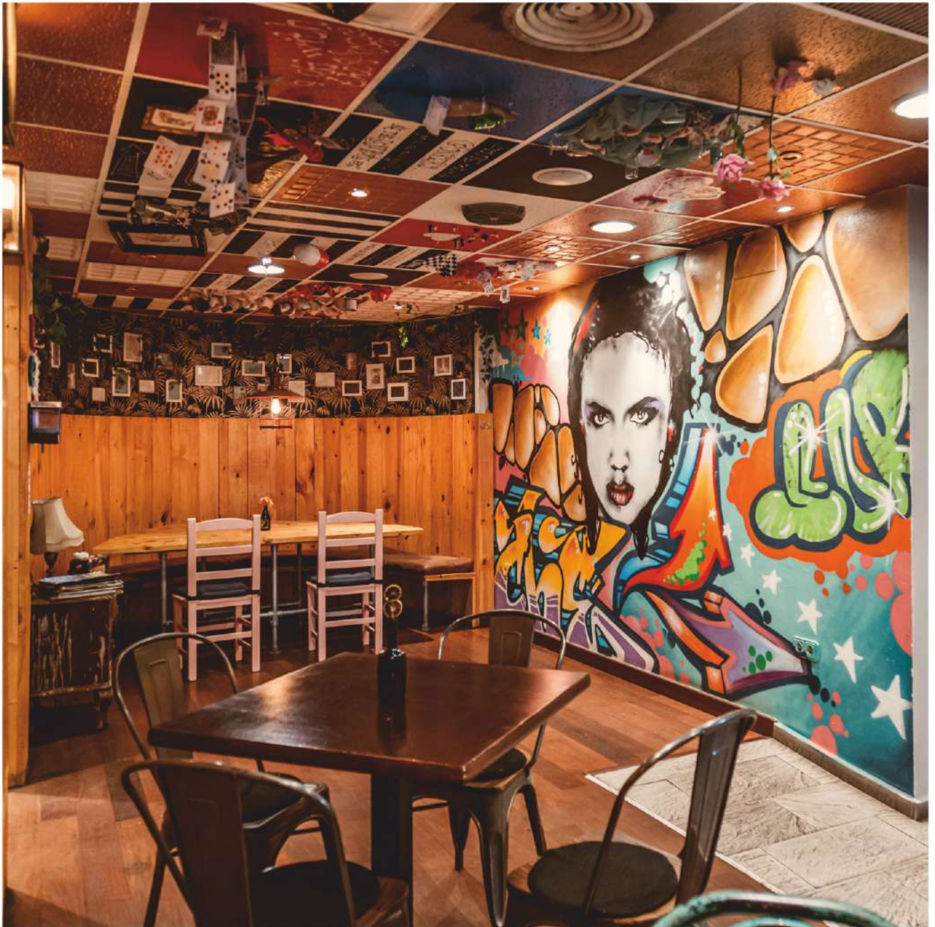
PROJECT SOCIAL BAR & KITCHEN