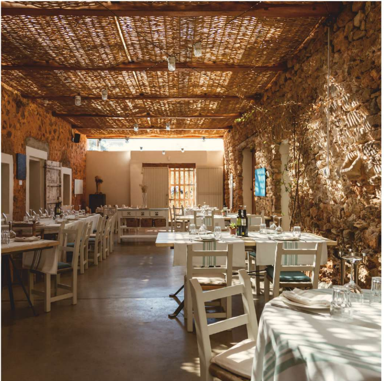
OLEOTECA SES ESCOLES