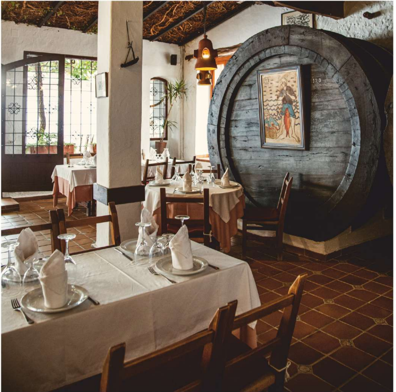
CELLER CAN PERE