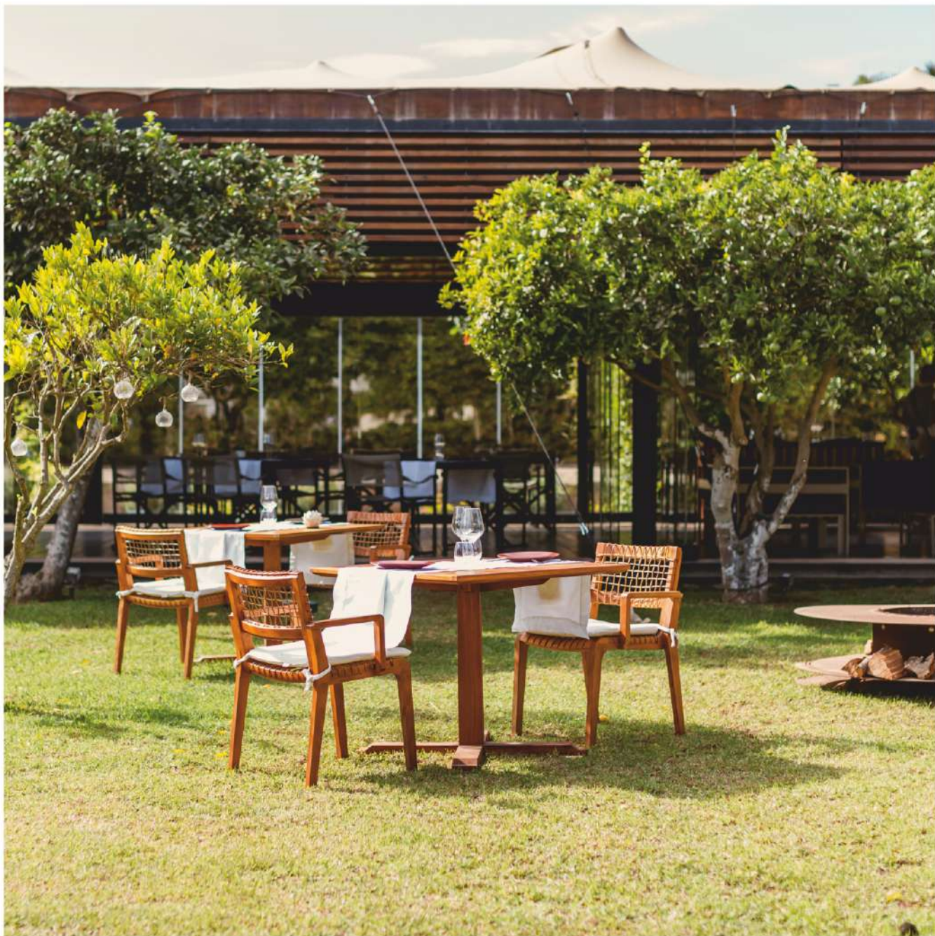
HOREL RURAL XERECA