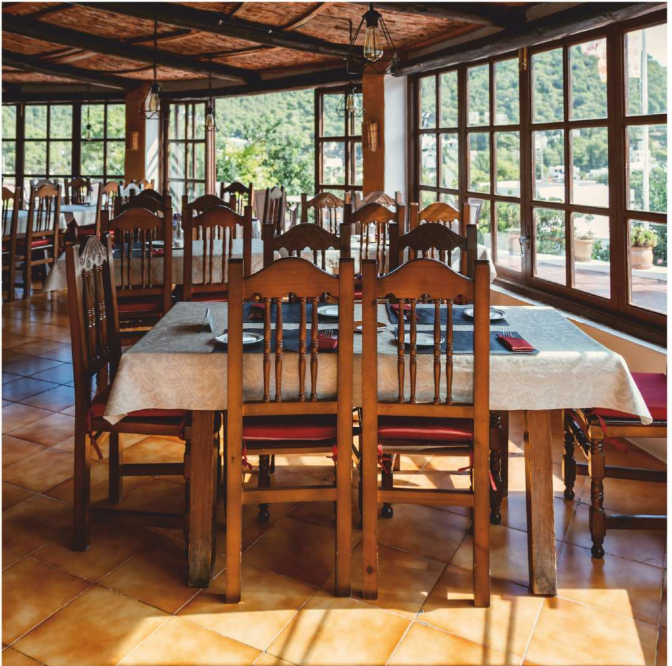
THE WILD ASPARAGUS