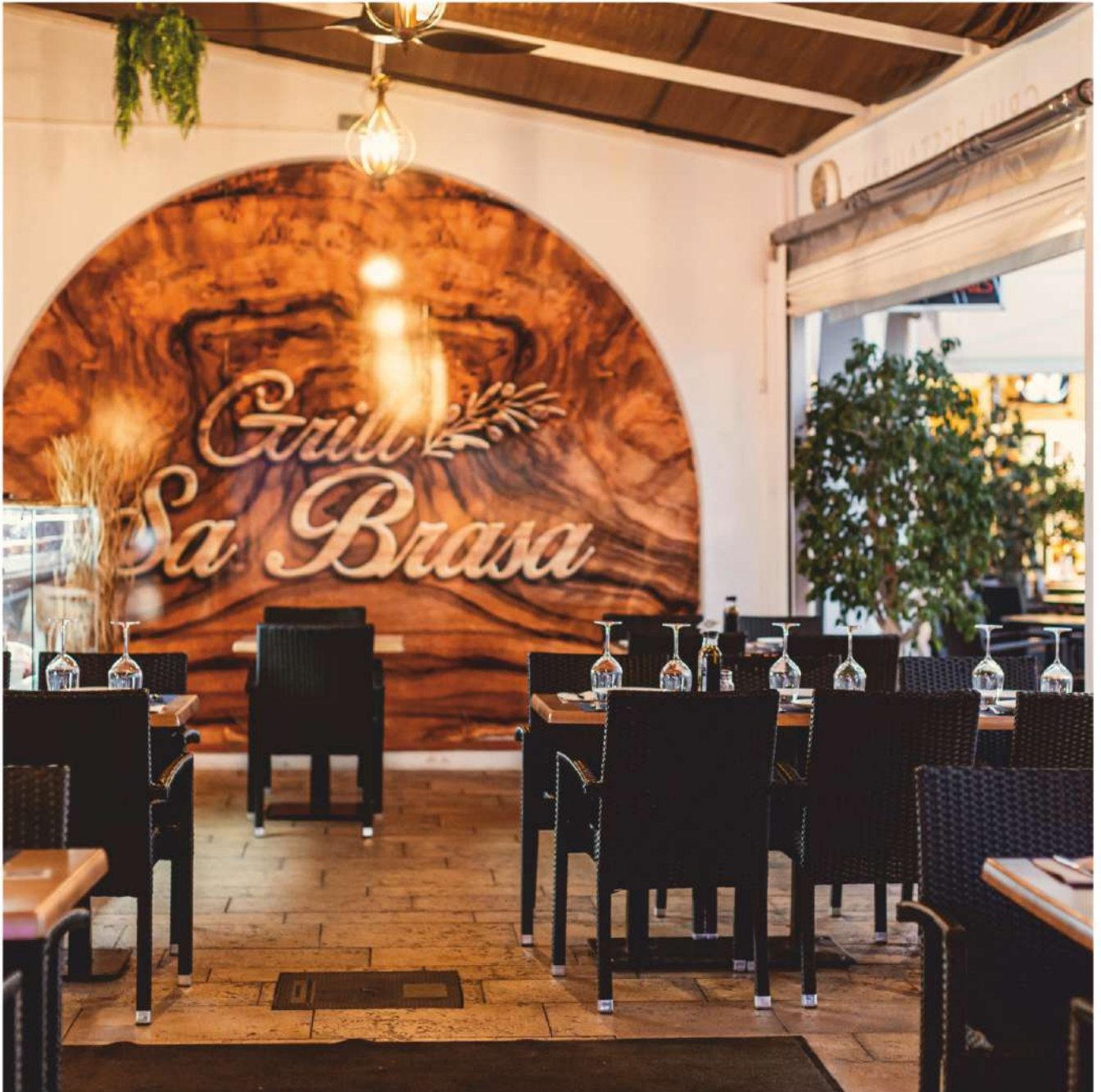
GRILL SA BRASA